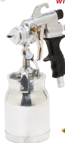
E7000 Non-Bleeder with Bottom Cup