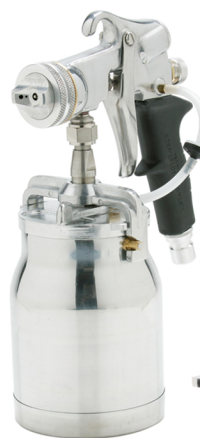
E5011 Bleeder with Bottom Cup