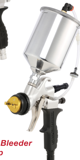
E7700GTO Non-Bleeder with Gravity Cup