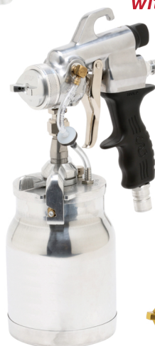
E7000 Non-Bleeder with Bottom Cup